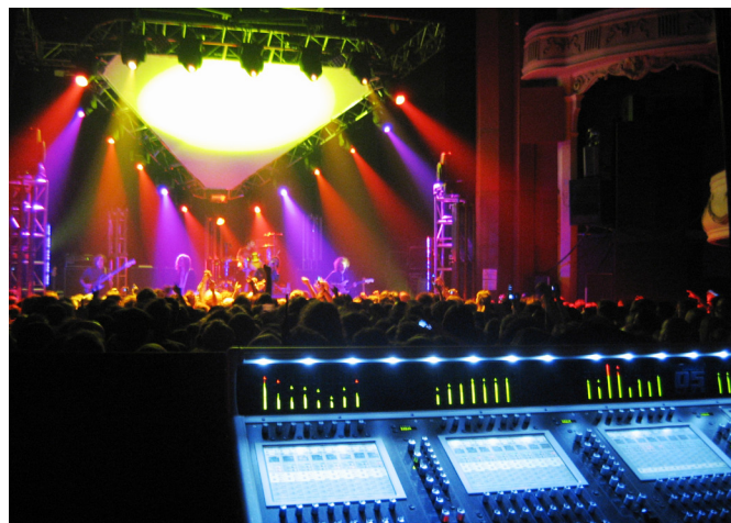
A Digico sound mixing console in action at a concert

The C Share Fund holds thirteen investments, the majority of which are also in the same companies as the Ordinary Share Fund. Of the investments unique to the C Share Fund, Focus Pharma continues to trade in line with expectations and is seeking to secure further new product licences.